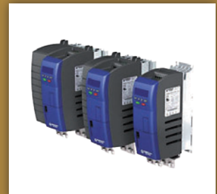
Electrical and Electro- Mechanical Drive Systems