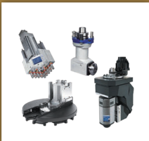
Components and Assemblies