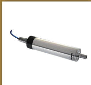
High Speed Spindles