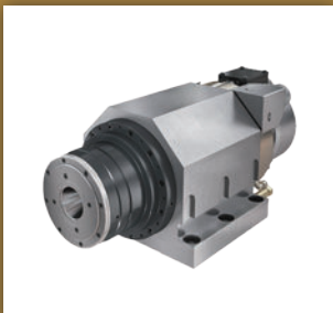
Motor-Spindles for Stone Processing