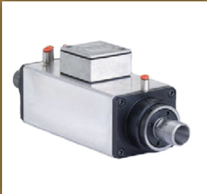
MTC Electric Motors for Dry Machining

Wherever a chip is generated in industrial production, HS Drive TeC has the complete solution package including a processing motor, a drive unit designed and programmed for this purpose and a full set of accessories.