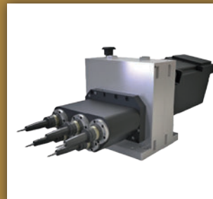
Optimized Special Solutions