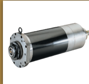
Motor-Spindles for Metalworking