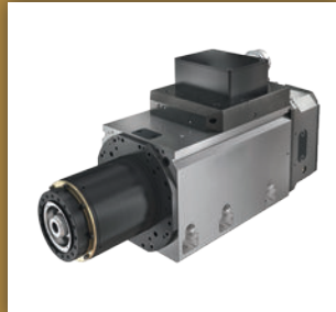
ATC Motor-Spindles for Dry Machining