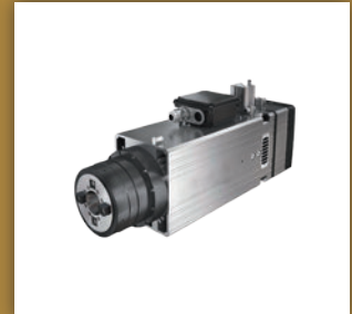
Motor-Spindles for Glass Processing